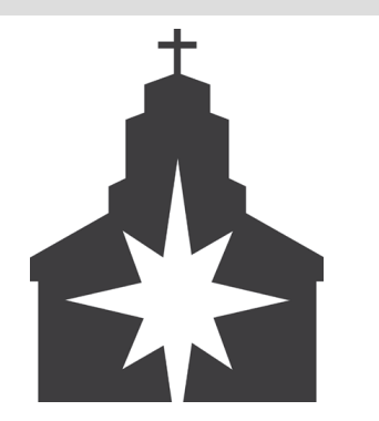
If necessary, take this brochure and your list of sins with you to confession.